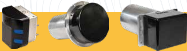
ARGOS Forward Looking Sonars