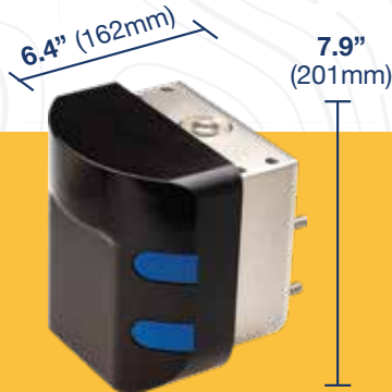
ARGOS350 Transducer Module